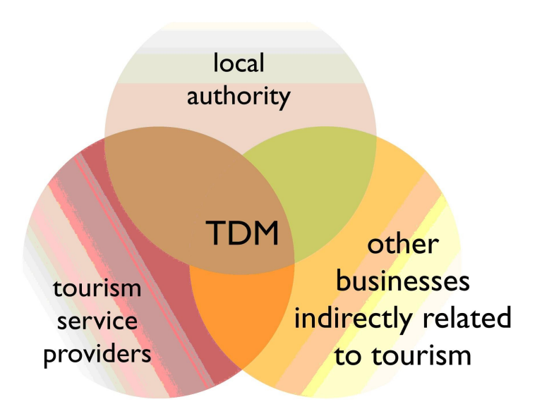
Figure 3. Development of the destination organisation