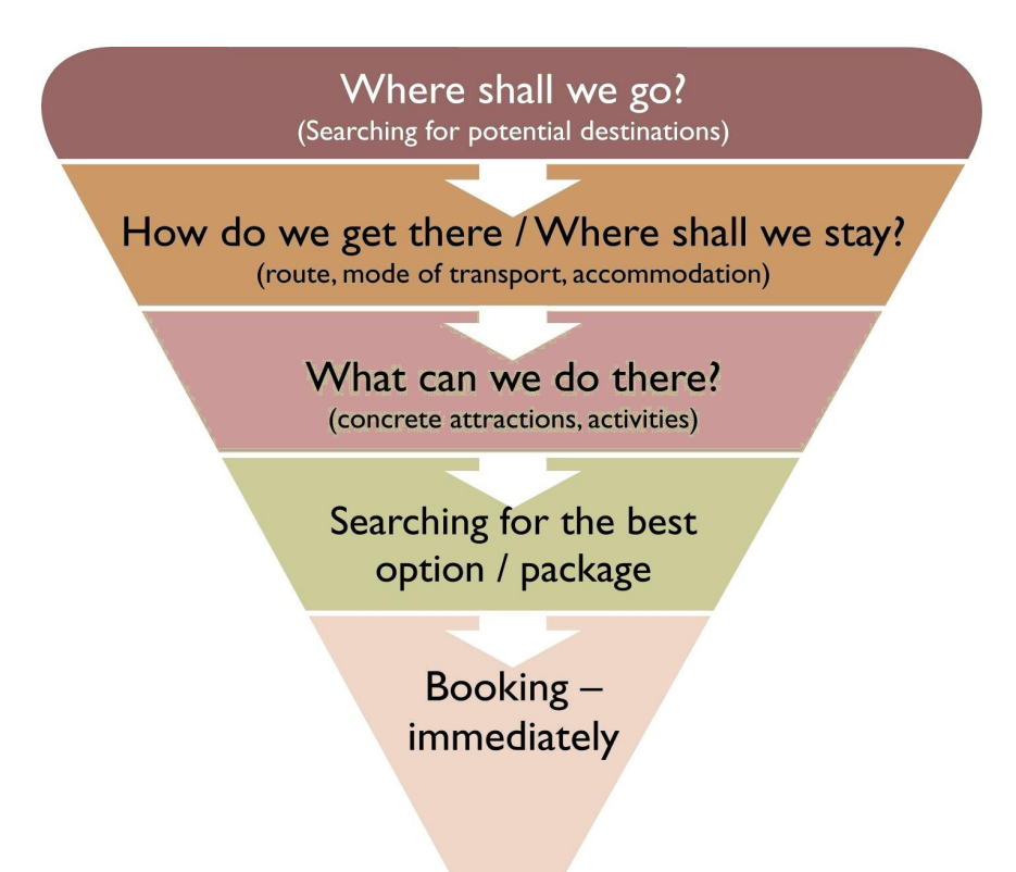
Figure 1. The decision-making process of destination selection and booking

However, there is a real danger that the players providing the elements of the tourism offer, which are mainly small and medium-sized enterprises (such as hotels, restaurants, attractions and events) will disappear on the world-wide web or do not have the necessary resources to run a tourism website and undertake e-marketing activities on a daily basis. A cost-effective solution to the outlined problem is to collect and focus the elements of supply through the tourism management organisation of the destination